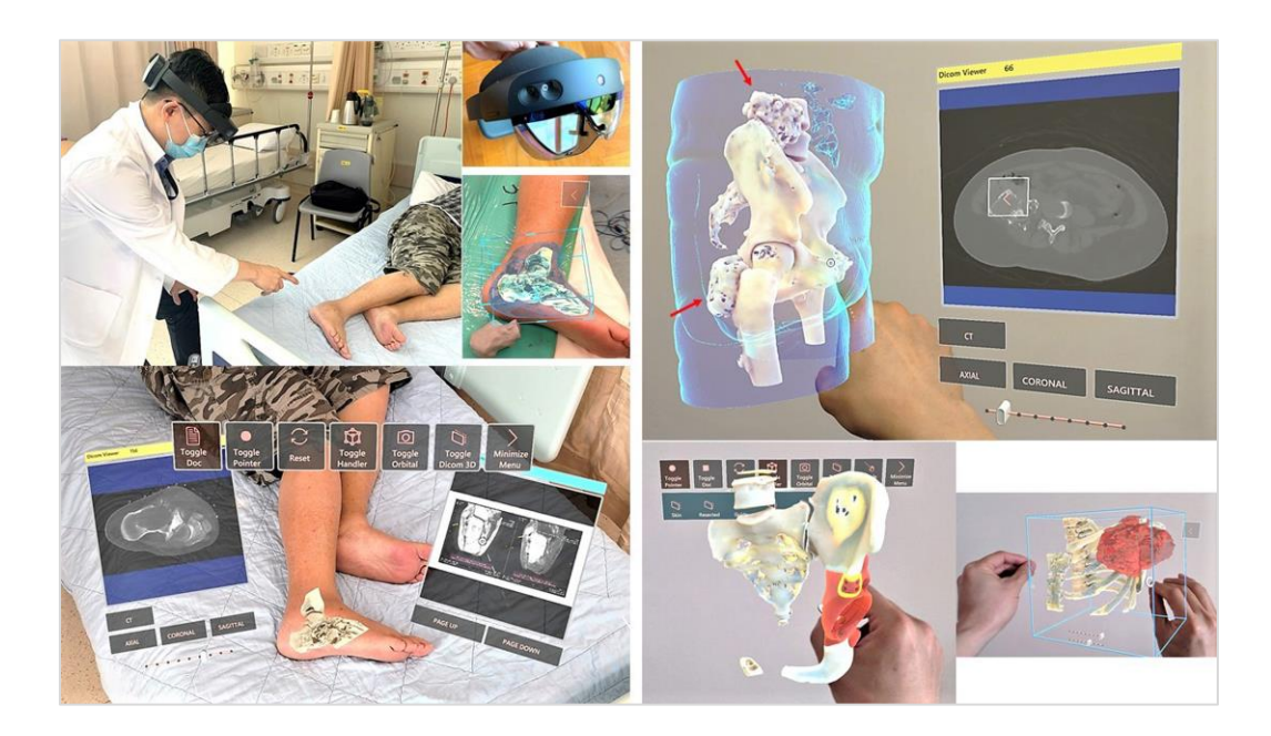
Figure 1: The use of mixed reality in Orthopaedic Oncology