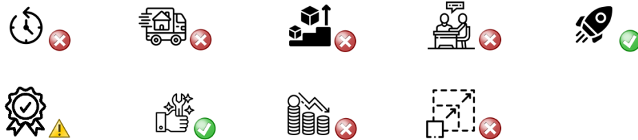
Figure 2: Fulfillment of project-specific expectations from the cloud migration at a glance.

Based on the retrospective alignment between our previous expectations and actual observations, we can summarize our recommendations as follows: