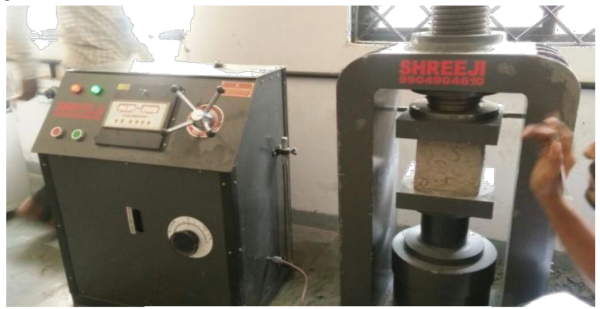
Figure 3: Compression testing machine

A mix M25 grade was designed as per Indian Standard method (IS 10262-2009) and the same was used to prepare the test samples. For M25 grade of concrete, 6 cubes were casted for each batch of A0, A1, A2, A3, A4, A5, A6, A7, A8, A9. Concrete cubes having size of 150 cm x 150 cm x 150 cm were prepared for all mixes to test 3 samples of a mix at 7 and 28 days. Slump cone test was performed on all mixes to assess the workability of concrete for different percentages of replacing materials. Compressive strength test was conducted on cubes after 7 and 28 days curing period as shown in figure no.3, for each batch, 6 samples were tested. Compressive strength of each mix is taken as average of the 3 samples.