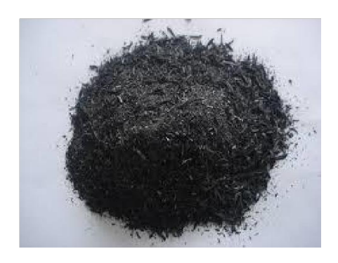
Figure 1: Rise husk ash