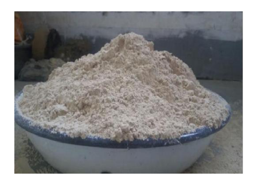
Figure 2: Ceramic powder