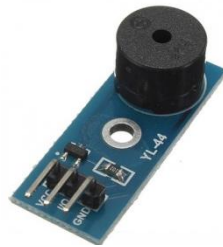
Fig 4: BUZZER

A buzzer or beeper is an audio signaling device, which is piezoelectric, which needs voltage with different frequency so that it can make sound accordingly. The pitch becomes louder when the frequency gets higher[10].