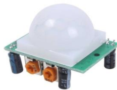
Fig 3:PIR SENSOR

PIR sensor detects a human being moving around within approximately 10m from the sensor. As the actual detection range is between 5m and 12m. PIR are made of a pyroelectric(passive) sensor, which can detect levels of infrared radiation [8]. Most PIR sensors have a 3-pin connection at the side or at the bottom. One pin for the ground, another pin will be signal and the last pin for power. Power is usually up to 5V [9].