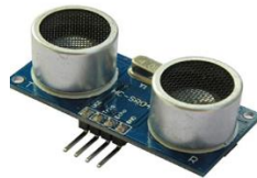
Fig 2: ULTRASONIC SENSOR

An ultrasonic sensor is an instrument that generally measures the distance to an object using ultrasonic sound waves, the working principle of this module is simple as follow. It sends an ultrasonic pulse out at 40kHz which travels through the air and if there is an obstacle or object, pulse will bounce back to the sensor [8]. By calculating the travel time and the speed of sound, the distance can be calculated.