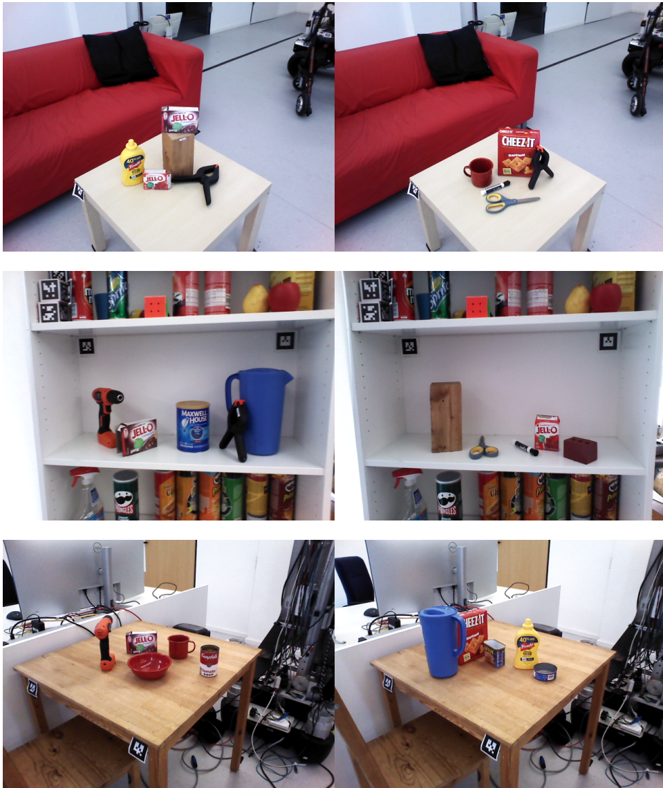
Fig. 2. Some frames of the test dataset (above: couch table, middle: shelf, below: table)