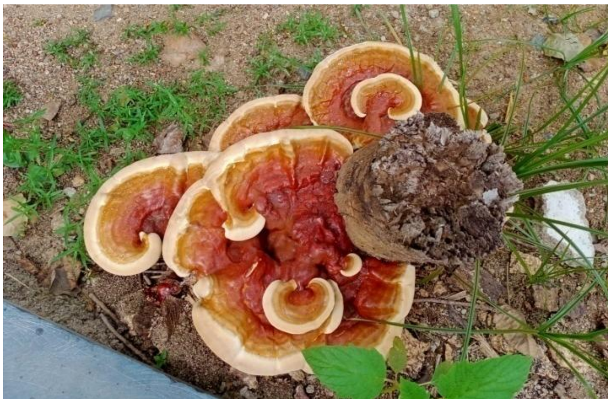
Figure 1: Ganoderma lucidum

Ganoderma lucidum is a wood-degrading fungi that belongs to basidiomycetes is very rare in nature that has pharmacological effects (Boh et al., 2007). In Latin, lucidum means shiny or brilliant appearance on fruiting body showing a symbol of good fortune, happy augury, longevity, good health, and even immortality (Wasser, 2005). It has good therapeutic potential in the promotion of health and longevity that is used extensively as “the mushroom of immortality” in Asian countries like China, Japan, Korea and India from past 2000 years (Sanodiya et al., 2009; Sliva, 2003). The dried powder of Ganoderma lucidum is mostly used in the treatment of cancer in ancient China. Ganoderma lucidum , an oriental medicinal fungus (Figure 1) showing a variety of biological activities like anticancer activity (Yuen and Gohel, (2005), anti-diabetic activity (Ma, et al., 2015), hypoglycemic effect (Zhang and Lin, 2004). antimicrobial and antioxidant properties (Zhu et al., 1999; Kamra and Bhatt, 2012).