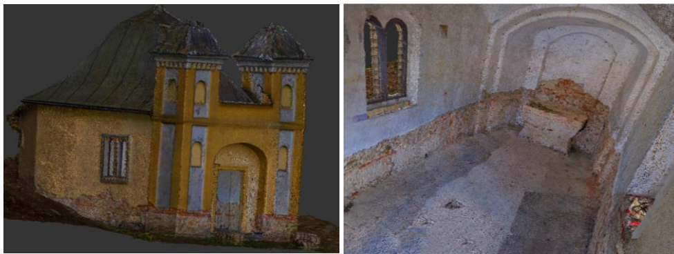
Fig. 1. Interior and exterior chapel model

The microgravimetric survey is conditioned by the determination of the dimensions and the volume of the walls of the building in which the microgravimetric survey is carried out. The best way to determine these values is to create a 3D model of a measured object. Therefore, before we started with a microgravimetric survey in the St. Mary's Assumption Chapel, it was necessary to measure the chapel with a 3D scanner. We used the Leica C10 scanner for both interior and exterior measurements. The complete scan of the chapel consisted of two interior scans and five exterior scans. After registering all of the scans and their subsequent cleaning from points outside the object of interest, we build a chapel composed of the point cloud with total number of 11 411 026 points. Exterior and interior of this model is displayed in Figure 1.